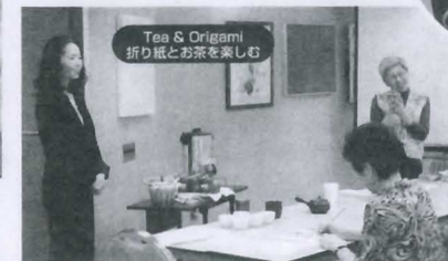
Tea & Origami 折り紙とお茶を楽しむ