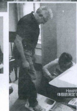
Health Check 体脂肪測定で健康チェック