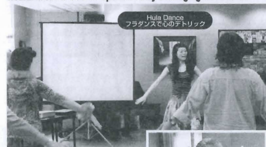
Hula Dance フラダンスで心のデトリック

このイベントには、子どもから高齢者まですべての年齢層を対象にしたもので、54の企画に約1400人の方が参加しました。