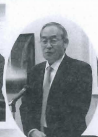
Greetings by Amb. Sakurai, 樺井大使もあいざつ